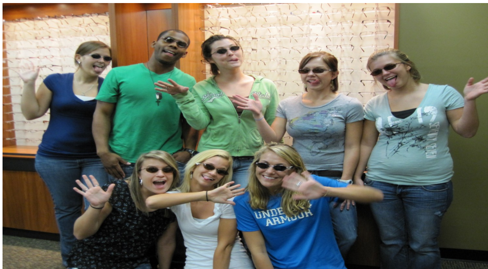
Roane State Community College students give a thumbs up as they are pictured here in front of their new frame displays.