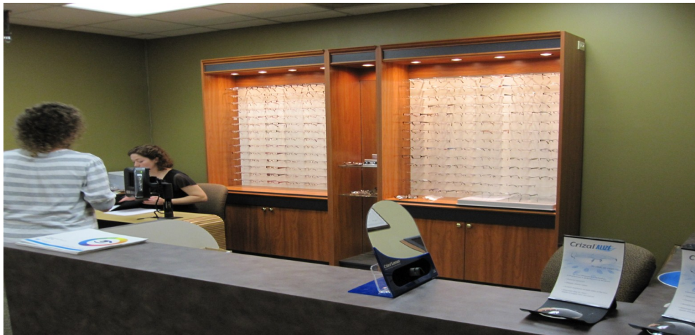
Students working in the newly remodeled dispensing lab at Roane State Community College.