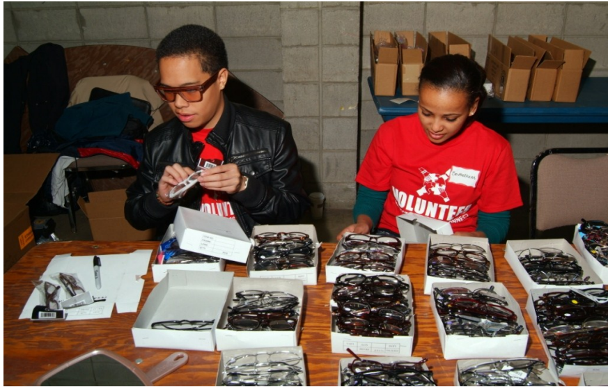
Additional photos of Seattle Central Community College opticianry students providing eyeglasses as part of the Homeless Project at the Tacoma Dome on October 14, 2010.